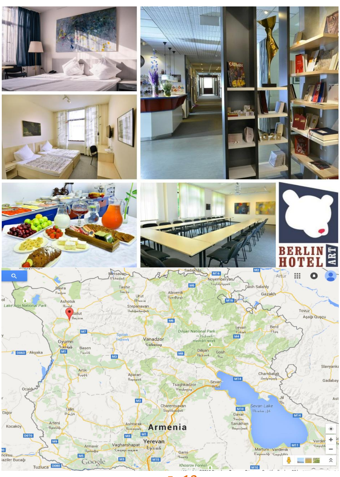
Page 5 of 12

The TC will be held in Gyumri – the city where the hosting organization is based and which is the second city of Armenia. The hotel where the participants will stay is called "Berlin Art Hotel" right in the city centre (Haghtanaki Street 25). The training venue is equipped with all the necessary facilities and conveniences. The participants will be accommodated in 2-beds and 3-beds rooms. Each room has private bathroom and toilets. Bed linens and towels are provided.