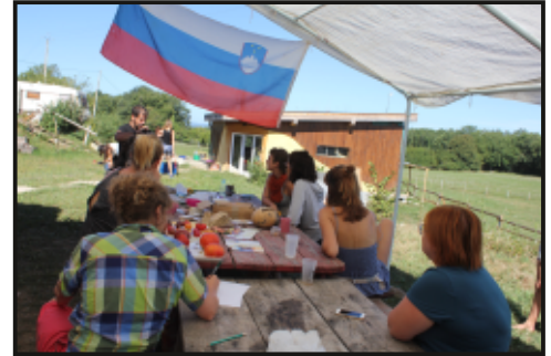
Outdoor common areas where to live, eat, work, rest, meet, sunbathe...