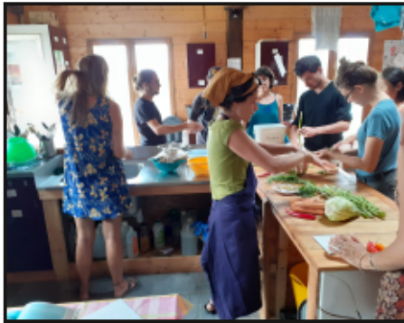
Indoor common areas where to live, cook, work, rest, have fun... and in case of rain !