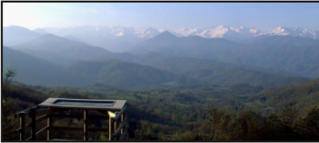
At the foot of the Pyrenees...

This place allows us countless possibilities for workshops, activities, parties.